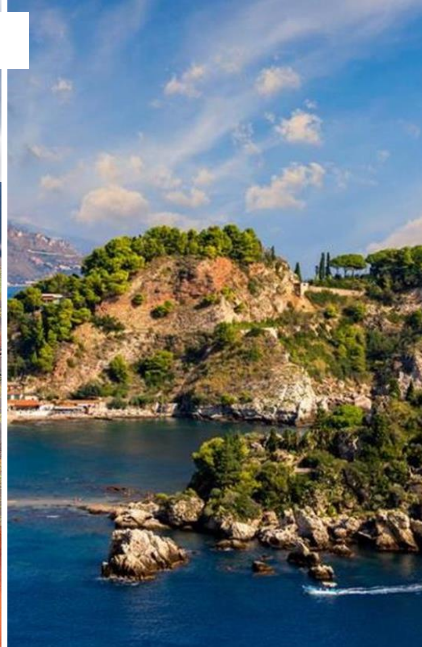
Taormina in Yacht