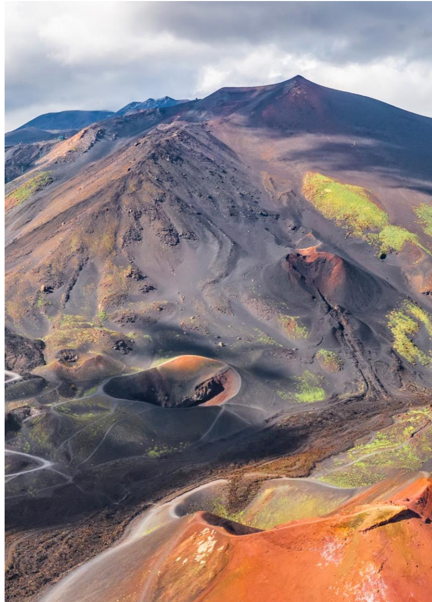
Etna and Gole dell'Alcantara