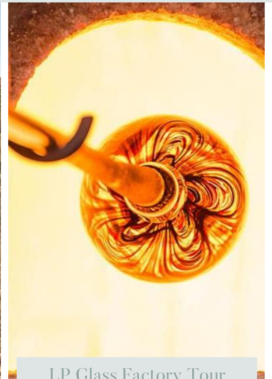
LP Glass Factory Tour